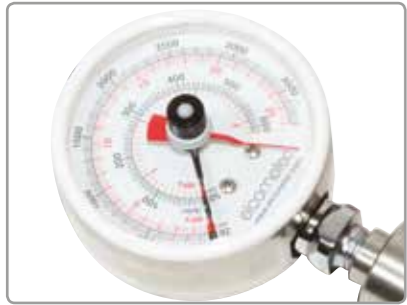
Digital and analogue gauges available for both harsh and hazardous environments

ASTM D4541, ASTM D7234, AS/NZS 1580.408.5, BS 1881-207, DIN 1048-2, EN 12636, EN 13144, EN 1542, EN 24624, ISO 16276-1, ISO 4624, NF T30-606, NF T30-062