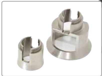
Actuator skirts for a range of substrate thicknesses and bond strengths, on flat or curved surfaces

Hand-held, ergonomic and fully portable - ideal for on-site adhesion testing