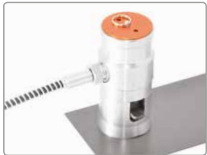
Low height actuator allows access in restricted areas. Safety harness clip prevents accidental damage of surrounding areas during test on vertical surfaces